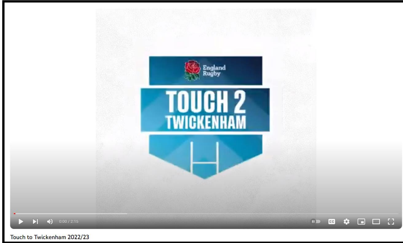
Touch to Twickenham 2022/23